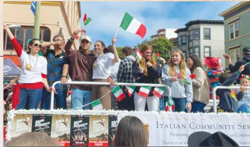
ICS Clients, Volunteers, Staff, Riccio Grant Recipients and Club Fugazi Experiences staff on our Casa Fugazi float

Casa Fugazi remains a prominent figure for entertainment and a sanctuary for the Italian Community. Thank you Club Fugazi Experiences for partnering with ICS for this year's float and for joining Italian Community Services in honoring the history of the beautiful building that is Casa Fugazi, a true gift to the Italian community in North Beach.