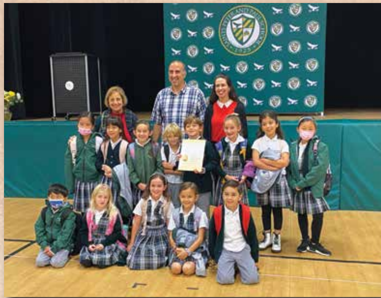
Saints Peter and Paul School grant recipients

Italian Community Services' John C. Riccio Grants provide financial support to Bay Area Italian language programs. These programs use the grant for a variety of purposes, including to enhance their learning materials such as textbooks, supplies, and technology; to create immersive cultural experiences for their students; and to provide professional development opportunities to their faculty. These grants ensure that these Italian programs are well-equipped to teach and support students with the best materials, tools, resources, and opportunities available.