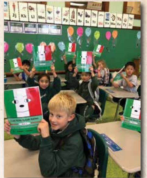
Saint Peter and Paul School