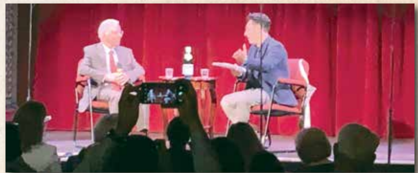
One of Silicon Valley's influencers, Federico Faggin, was honored by the Leonardo DaVinci Society at Casa Fugazi.