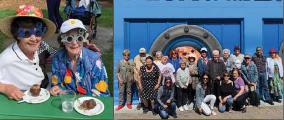
Pic-Nic at Golden Gate Park