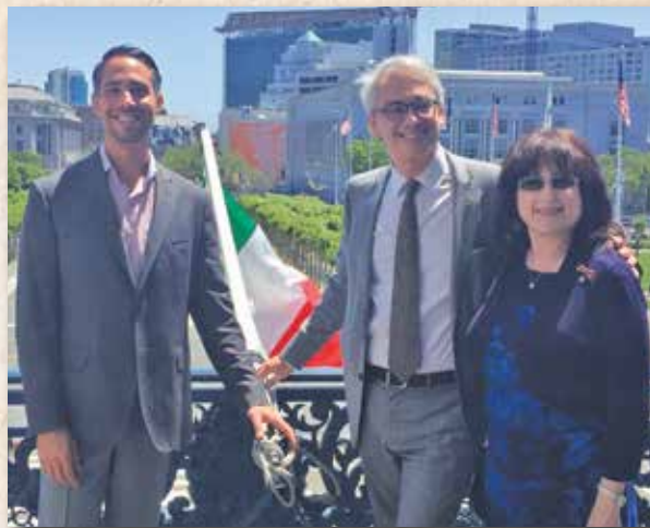
ICS invited to Italian Flag Day hosted by SF Major.