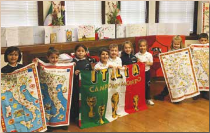
Saint Catherine of Siena

This year we continued our dedication and attention to the John C. Riccio Grant Program. La Scuola International, Saint Peter and Paul School, Italingua and Saint Catherine of Siena all received generous donations to support their highly successful Italian language initiatives.