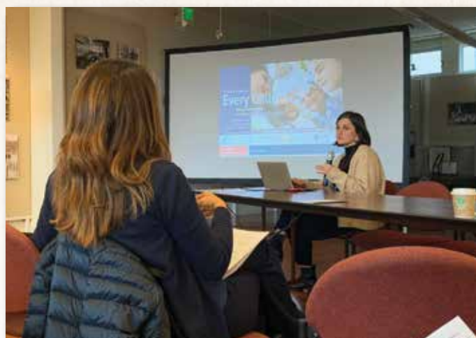
We were honored to host the Every Child conference on autism and children with special needs. Much of today's research in the field of autism is coming from Italy. This was a truly international affair with over 150 participants from 35 countries. Thank you Zoom technologies for making this possible.