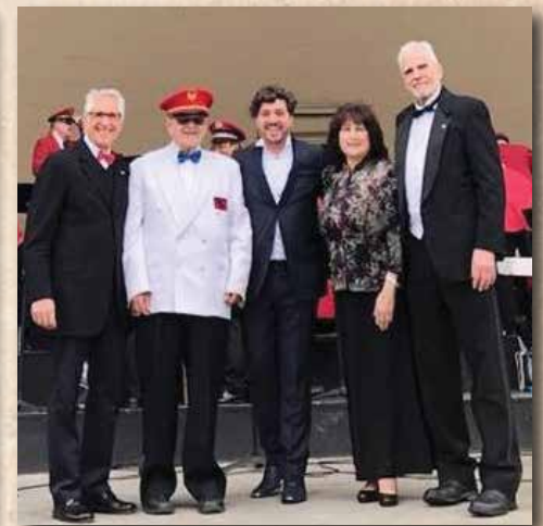
ICS proudly funded the "Italian Music in the Park" concert in Golden Gate Park.