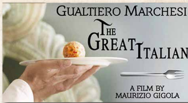
Movie featuring Gualtiero Marchesi, the father of modern Italian cuisine was coupled with dinner catered by San Francisco's top Italian restaurants.