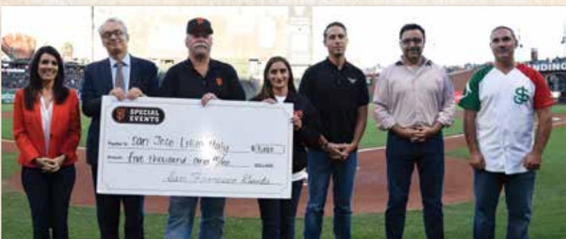
ICS hosted at the Giant's Italian Heritage Game.