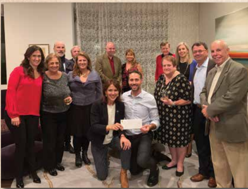
Members of ICS and La Scuola International boards held an aperitivo and delivered in person the Riccio Grant funds.