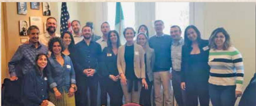
One of Europe's leading business schools, the SDA Bocconi, held its annual North/South America Leader's conference at Casa Fugazi in July.